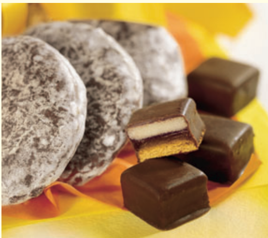
Natural colourings, real fruit flavour – the ideal starting point for modern products.